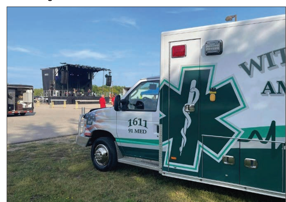
Wittenberg Ambulance overlooking Ho-Chunk Gaming Wittenberg's stage.