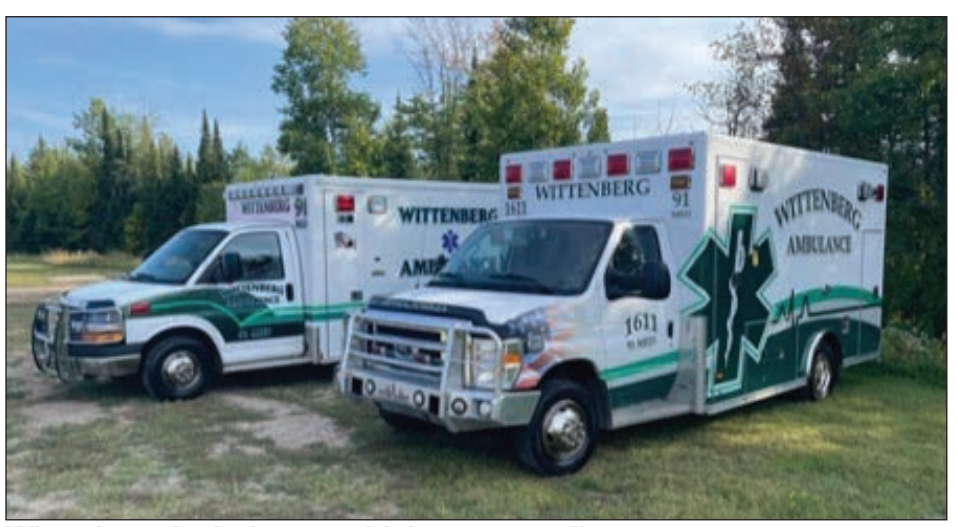
Wittenberg Ambulance vehicles on standby.