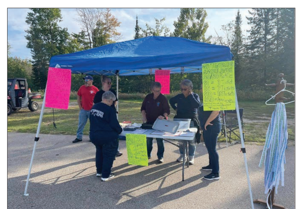
Wittenberg Ambulance members at raffle tent.

Ho-Chunk Gaming Wittenberg is tremendously grateful for services provided by the Wittenberg Area Ambulance and Fire Departments in providing services to those in attendance of our facility and surrounding areas. Knowing skilled and caring workers were available in case any emergency need happened to arise allowed all in attendance to enjoy the summer concerts in a fun and carefree way.