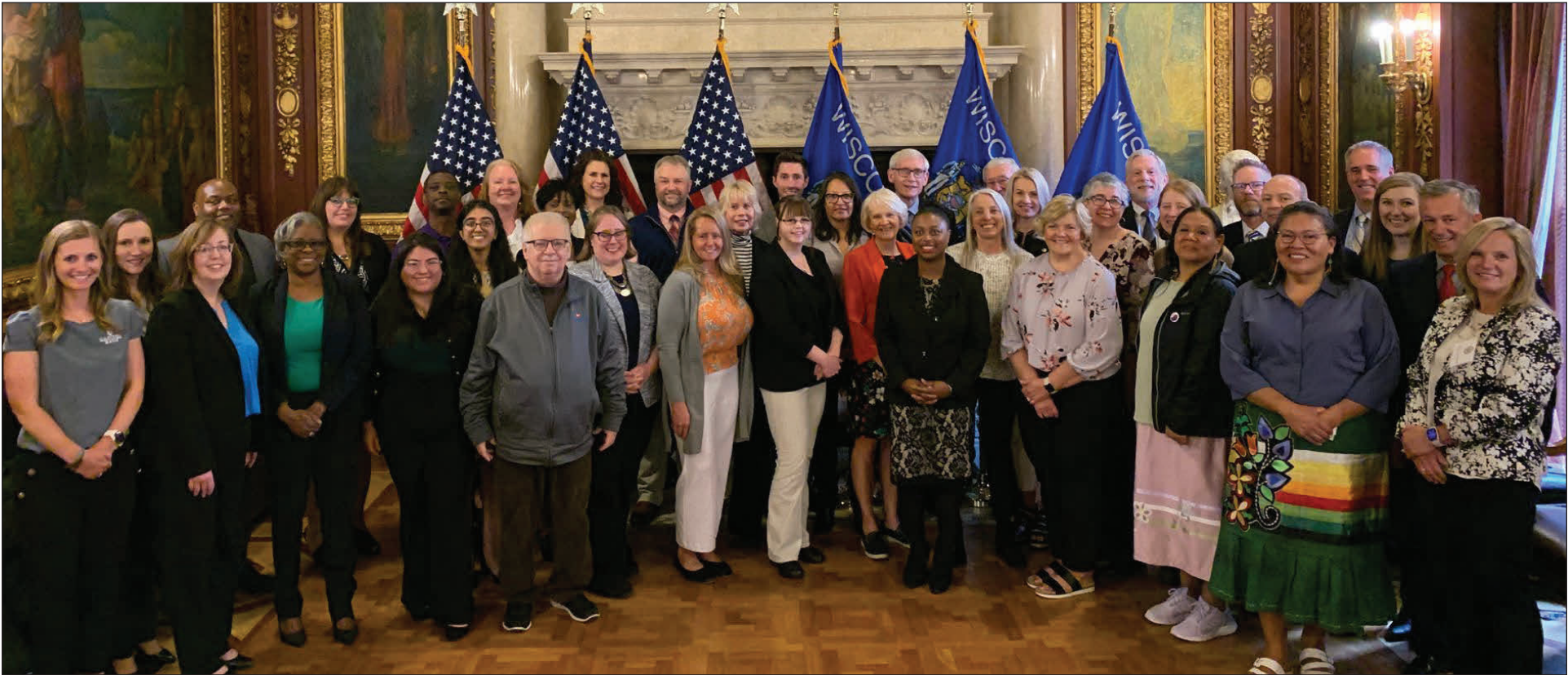
Award Recipients Group Photo