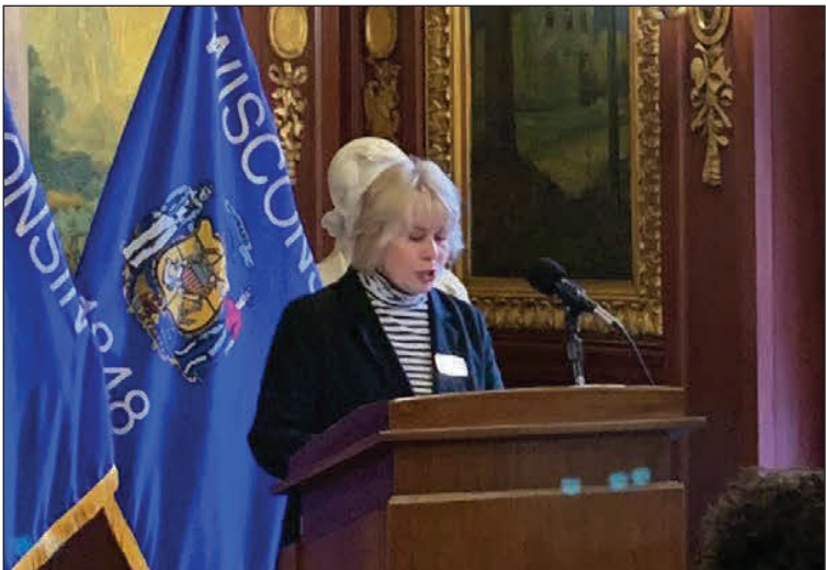
DFSI Secretary Designee Olson Collins

The recipients were selected by the Governor's Council on Financial Literacy and Capability from the nominations submitted for consideration. Criteria used to judge nominations included: innovative implementation of an effective financial literacy and capability program or program element within the last two years; emphasis on financial inclusion, demonstrated measurable results; collaboration with partners; and scalability of the program design. Visit the Council's webpage to read a Continued on Page 15